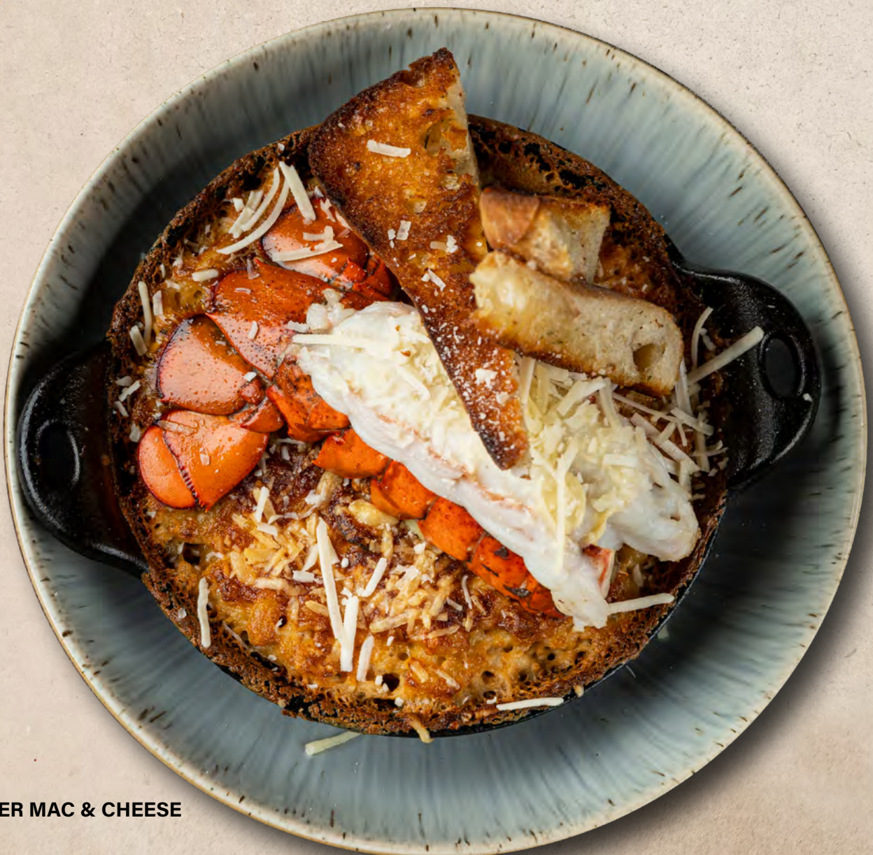
LOBSTER MAC & CHEESE

Penne with ground Italian hot sausage, chicken, and sautéed onions in a tomato cream sauce. Topped with a trio of melted cheeses.