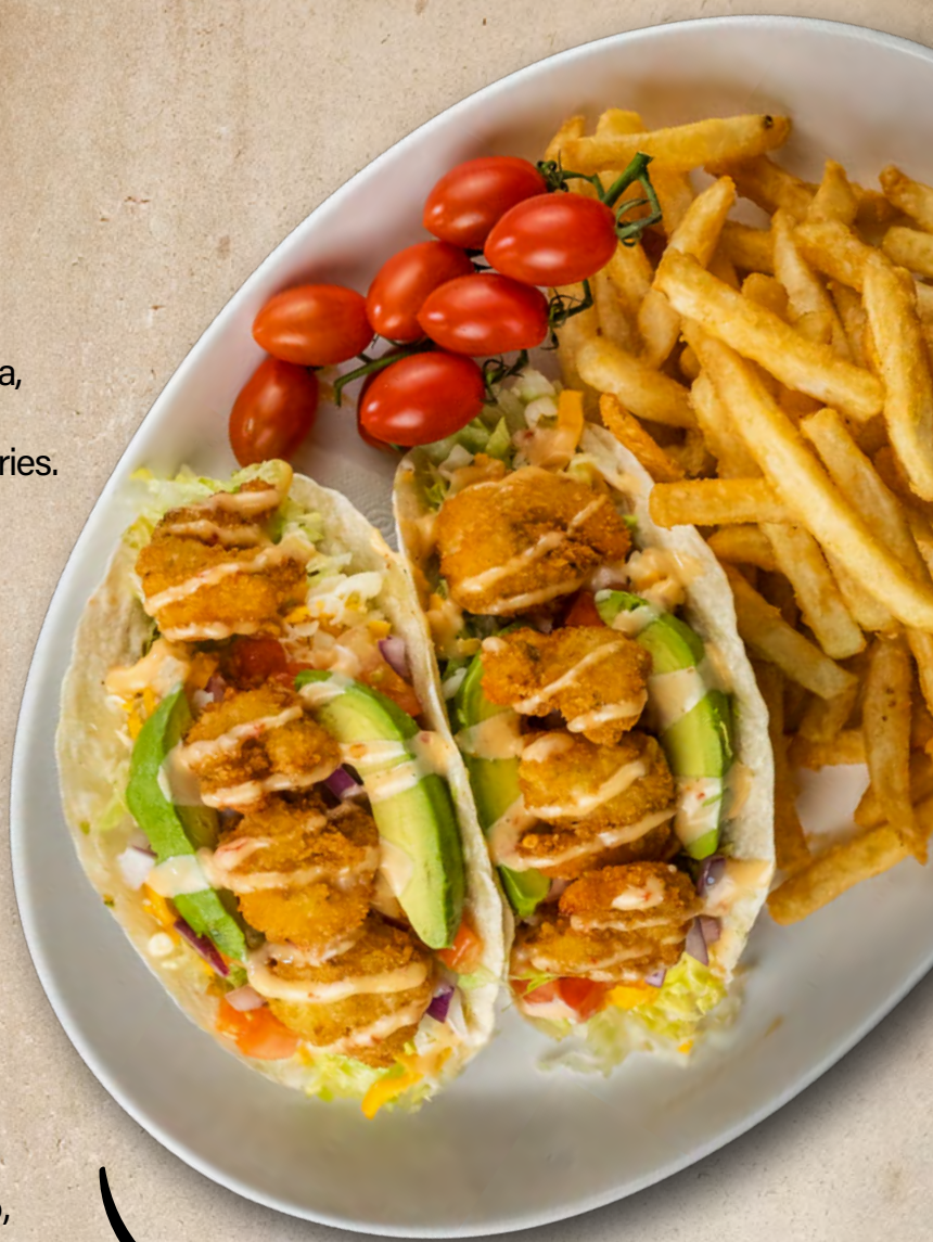
JALAPEÑO SHRIMP TACOS

Crispy cauliflower with lettuce, tomato, onions, avocado, Tex-Mex cheese, and buffalo ranch. Served with fries.