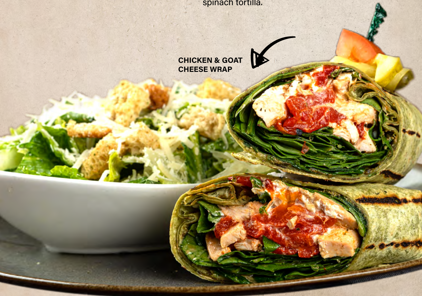
CHICKEN & GOAT CHEESE WRAP

Cajun chicken with avocado, red onion, tomatoes, shredded lettuce, and Swiss cheese drizzled with ranch, wrapped in a spinach tortilla.