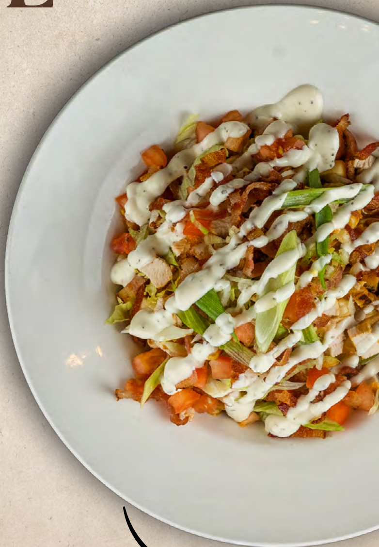
CHICKEN BLT POUTINE

Lattice fries with our signature butter chicken. Served with yogurt and green onions.